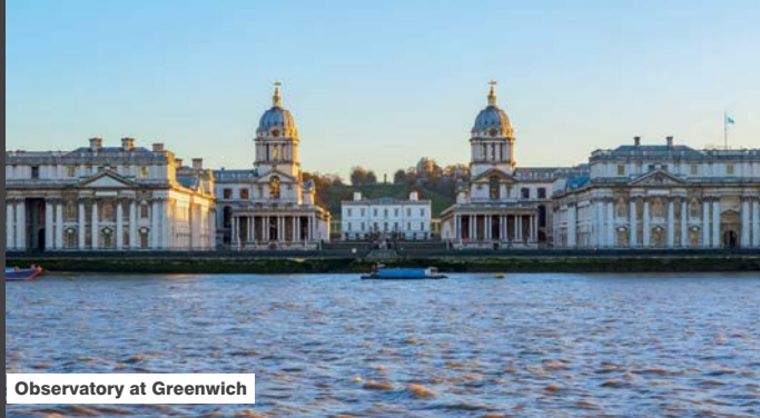
Observatory at Greenwich